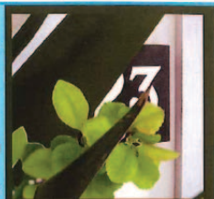
Cut back foliage regularly so that your number can be seen clearly. Bushes can hide the number, especially in Spring and Summer.