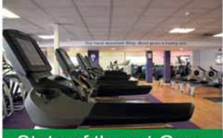
State of the art Gym

Contact us today to claim your FREE 7 DAY PASS and membership deals.